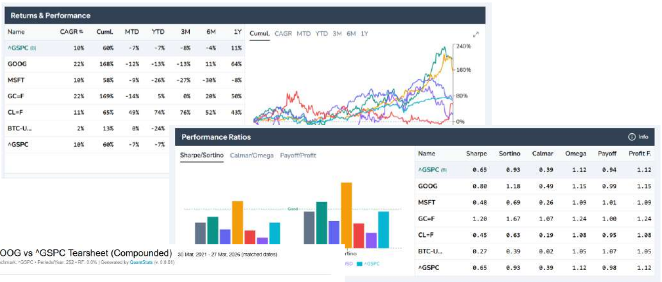
GOOG vs ^GSPC Tearsheet (Compounded)

Multi security comparisons - Risk, returns, drawdowns, benchmarks & tear sheets